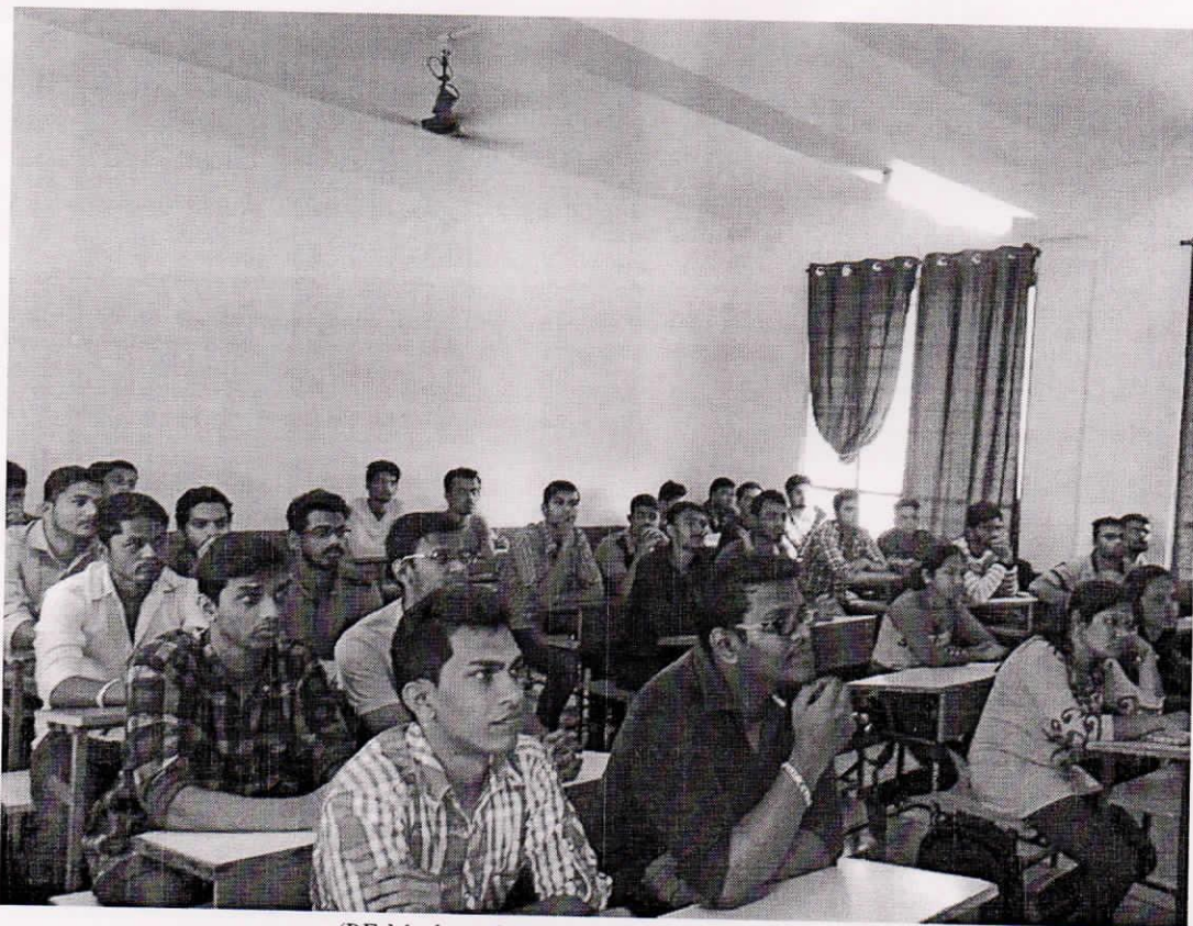
(RF Moch students undergoing the course)